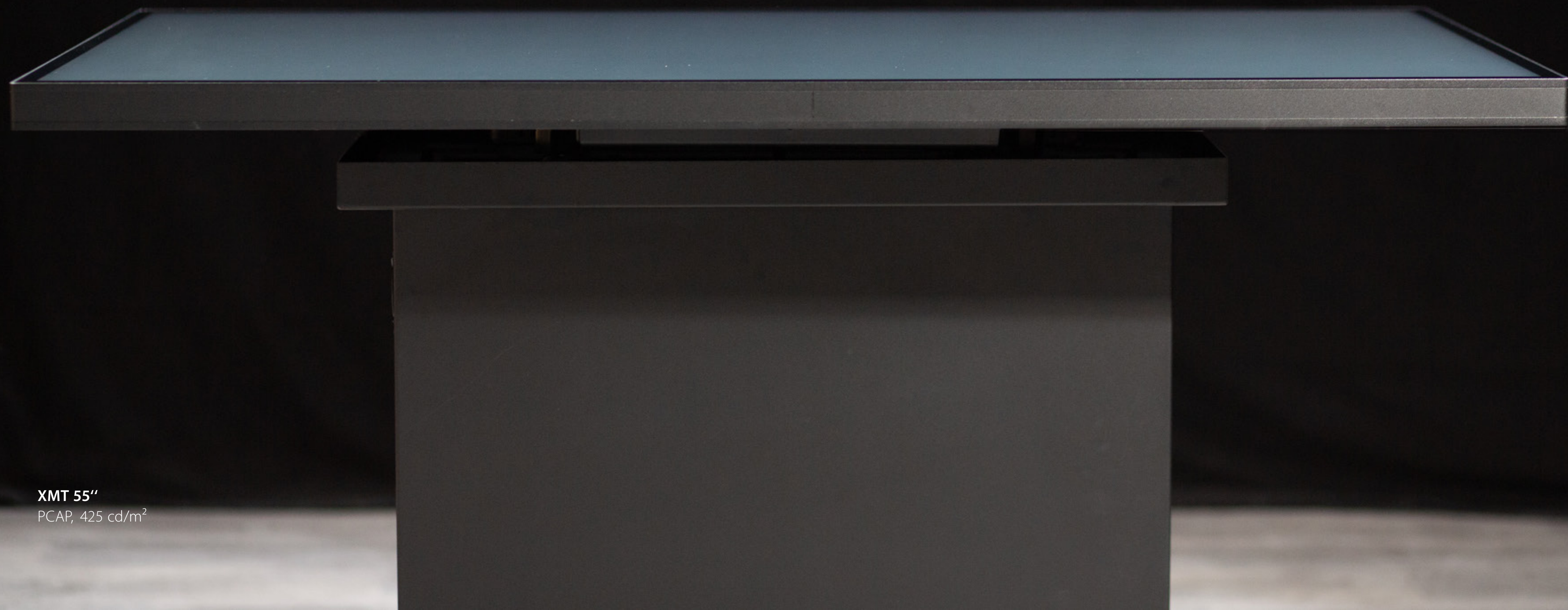
XMT 55" PCAP, 425 cd/m 2